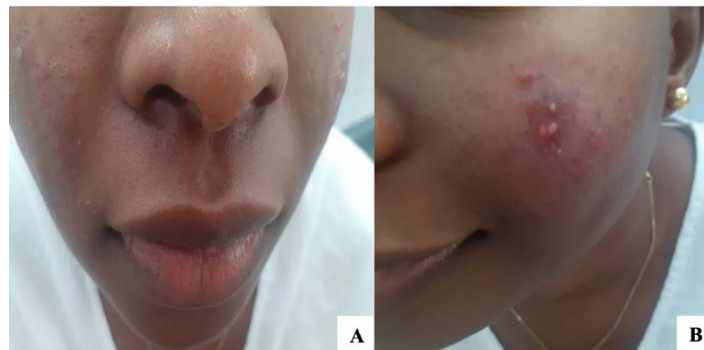
Fig. 1: Symmetrical rosacea-like demodicosis (A) with papulo-pustular lesions (B).

This is a 32-year-old woman, external auditor, who consults a dermatologist for redness of the cheeks, associated with desquamation, evolving for several weeks. This erythrosis has increased since returning from a work trip to a country in the sub-region. The interrogation reveals a notion of stress during this work trip. On clinical examination, a regressing chalazion in the left eye is observed, and symmetrical erythema of the cheeks, formed by superficial papulopustular lesions, evoking rosacea-like (rosaceiform) demodicosis (Fig. 1). In addition, the patient reports that she has had chalazion repeatedly for nearly four years. The rest of the clinical examination is without abnormality. She takes no medication.