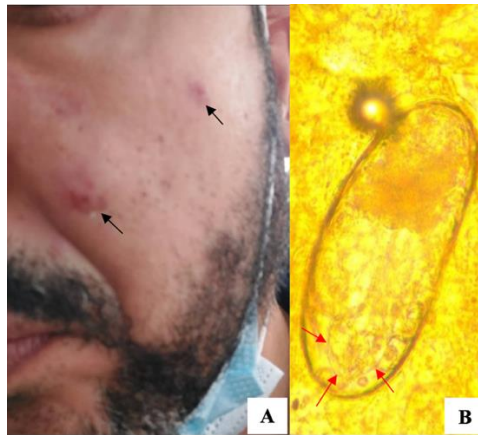
Fig. 3: Granulomatous-like rosacea demodicosis (A, black arrows), and embryonated egg of Demodex folliculorum showing an emerging larva (B, red arrows, x400).